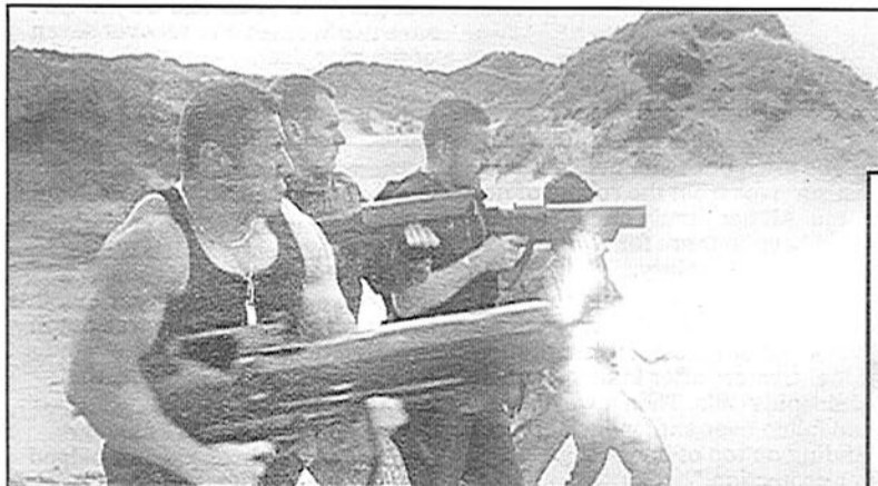
■ The cast of The Planet pictured in action on Balmedie Beach.